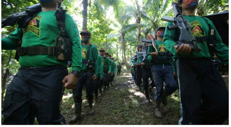
Guerrillas of the New People's Army, the military wing of the Communist Party of the Philippines, march at their encampment in the Sierra Madre mountains, southeast of Manila, Nov. 23, 2016.

The communists announced the move six weeks after the Philippine government – their enemy for the past half-century – declared that it would not follow Washington's lead by cutting ties with firms involved in China's building