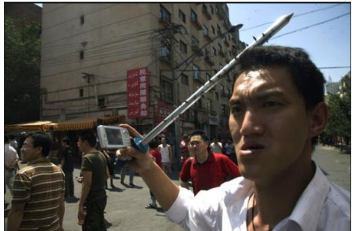
July 7, 2009, file photo, a Han Chinese man carries a spiked steel bar while using his cell phone to take photos as he joins a mob of Han Chinese men attacking Uighur properties in the aftermath of attacks by the Uighurs in Urumqi, western China's Xinjiang province.