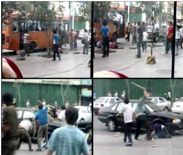
Urumqi Riots July 5, 2009: Cellphone Photos

The Big Rumble ...June 2009, two Uighur migrants on a state employment program were killed in a brawl at a toy factory in Shaoguan, 1,000 miles from home, in an industrial city in China's coastal Guangdong province....about alleged rapes of Han women by Uighur men. Isn't it always alleged rapes? A video made its way back to Xinjiang. July 5, 2009 , students in Urumqi organize a protest. Did the police shoot? Were the Uighurs looking for revenge? We'll never know, but an estimated 200 people were killed — stabbed, beaten or burned alive in the melees that followed that night.